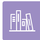
English System & Legal Research Skills